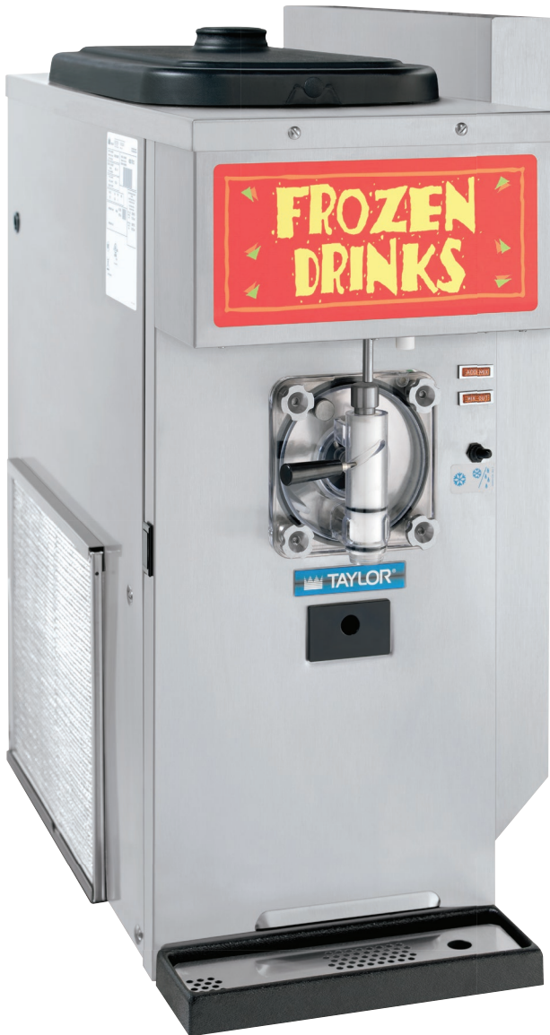
Shown with optional top air discharge chute

Removable, cleanable and reusable air filter keeps the condenser clean for optimal refrigeration system performance.